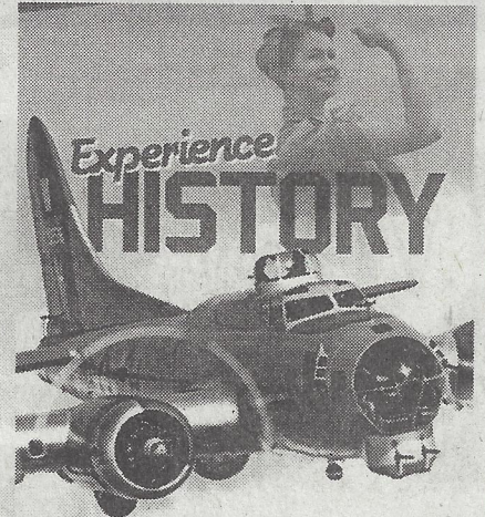
B-17 ALUMINUM OVERCAST (Friday - ALL DAY SATURDAY JULY 4TH - and Sunday)