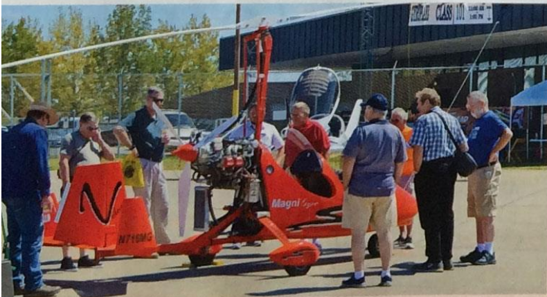
On-site classes were held to educate folks about the unique fun features of gyroplane flying.

Demo flying is one of the main attractions of Midwest. Your seat awaits you almost any time you like. Savage is represented by Sportair USA.