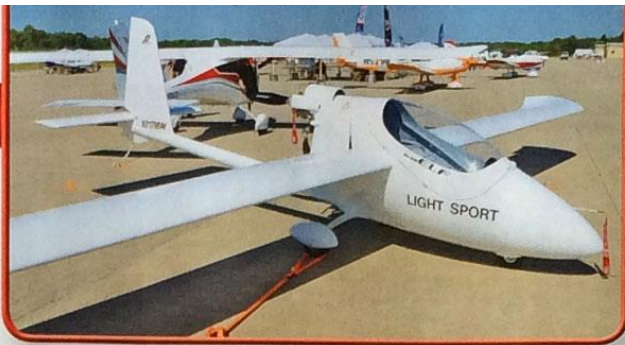
Some aircraft, like Ekolot's fun little Elf motor glider, made their first showing at Midwest.