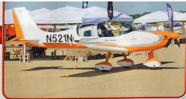
Vendors come from far and wide, like this Sling represented by The Airplane Factory USA out of California (with midwest dealer support).