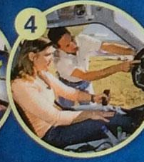
First Flight Lesson