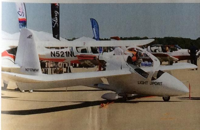
Ekolot Elf single-seat, all-composite motorglider.

The next airplane at Mount Vernon found in my search for low cost and higher performance was the two-place Belite Chipper, an amateur-built kit. Designer James Wiebe, EAA 859932, has latched on to an important concept to reduce the cost of a kit airplane. Building the Chipper out of flat aluminum honeycomb sheets reduces the complexity and the cost of the pre-manufactured components. It also reduces the building time and saves weight. The kit is reminiscent of a die cut balsa model kit, but instead of balsa, it is computer-controlled laser-cut honeycomb aluminum sheet material.