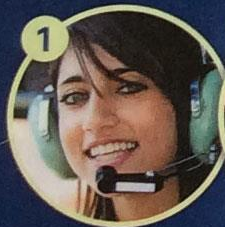
Young Eagles Flight