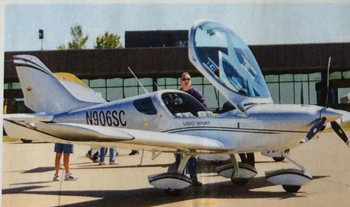
A 2016 Czech-built SportCruiser LSA from Joliet, Illinois.

It has been 10 years since the transition option for U.S. ultralight pilots to upgrade to sport pilot began. Thousands of pilots made the change, but many of us are still looking for low-cost flying at the higher level of performance. As it turns out, we can have it with the smart use of modern technology.