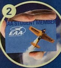
EAA Student Membership