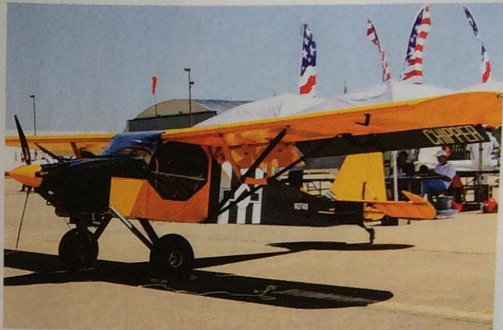
The Belite Chipper is low-cost, homebuilt, STOL fun.

The max level indicated airspeed that warm day was 99 mph at about 2,500 MSL. James said 90 mph is a reasonable high cruise. One of the landing approaches was deliberately high (too high for my trike), and a slip was used to dump excess altitude. It was a convincing demonstration. The cost of a Belite Chipper airframe kit is amazingly low. If it was teamed up with a used 80-hp Rotax engine, there might be hope for someone like me on a very tight budget.