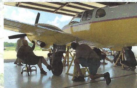
SRT Crew performs landing gear test swing