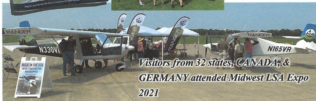
Visitors from 32 states, CANADA, & GERMANY attended Midwest LSA Expo 2021