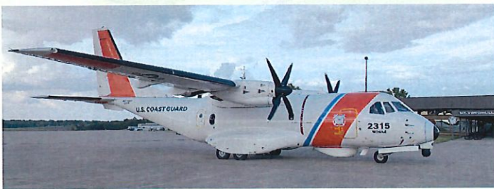
Coast Guard CH-144 and its crew of ten made the trip from Mobile, AL for dinner at Bonnie Cafe!