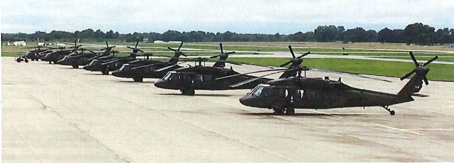
14 ARMY UH-60 "Blackhawk", operations, 28 service members fed, and 2100 gallons of Jet A Fuel sold!

First, airport restaurants are tough. To survive, they must rely on the support of non-flyers. Bonnie Cafe has worked hard to earn the trust of its loyal customer base. Second, airport restaurants have to be supported by the airport partnering with them. The Mt. Vernon Airport Authority and Bonnie Cafe enjoy a strong private/public relationship. Long term health and success is the main goal. This partnership leads to so many financial, statistical, and hospitality benefits for southern Illinois. Below are just a few: