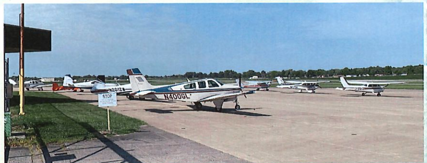
$100 Hamburger (aviation lingo) Visitors. Aviators from across State lines often visit for breakfast, lunch, or dinner - seven days per week!